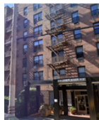
Queens, NY Loan amount $311,500