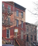
Bronx, NY Loan amount $1,115,000