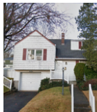
Bergenfield, NJ Loan amount $427,500