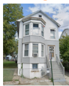
Elizabeth, NJ Loan amount $352,525