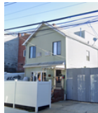
Maspeth, NY Loan amount $900,000