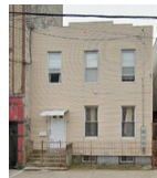
Long Island City, NY Loan amount $830,000