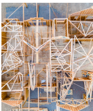
Jamaica, NY Loan amount $2,00,000