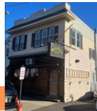
Elizabeth, NJ Loan amount $280,000